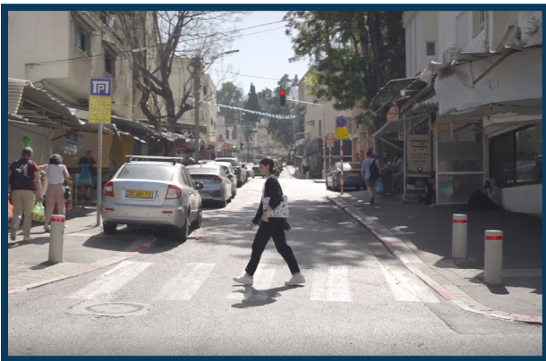
Munia in Haifa