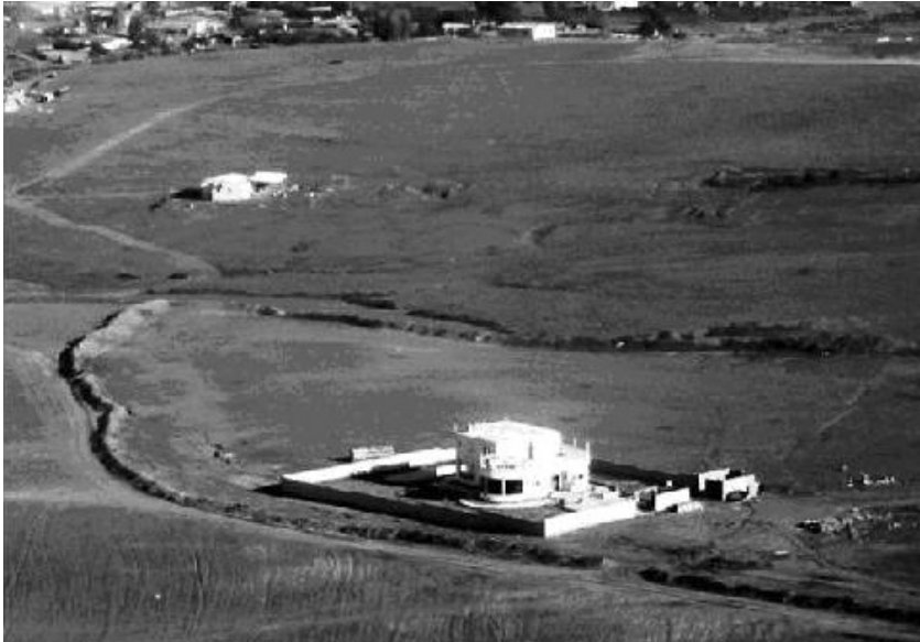
Illegal estate on state lands.

While most have taken advantage of the special terms offered by the state and have built their homes and businesses legally, a significant minority clearly feel they are not obliged to obey Israeli law. As a consequence, to put it bluntly, there is no feeling of law and order in the open lands of the Negev.