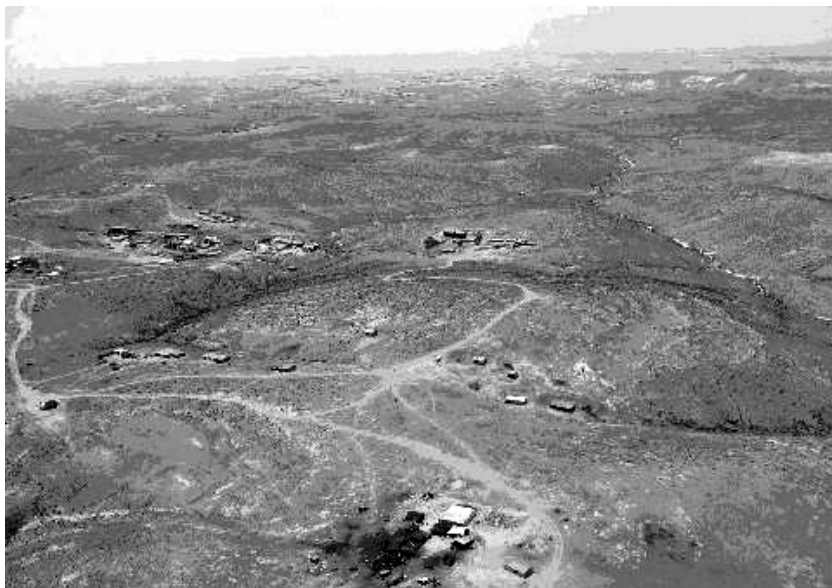
Aerial photograph of the Negev (2005).

Government approved a broad investment plan regarding the Bedouin of the Negev. 68 This important Government plan can be seen, in practice, as the turning point regarding the Bedouin issue.