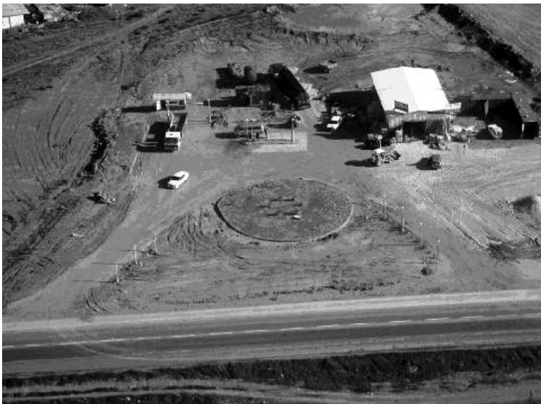
Illegal gasoline station.