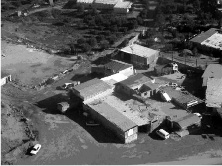
Illegal commercial constructions.