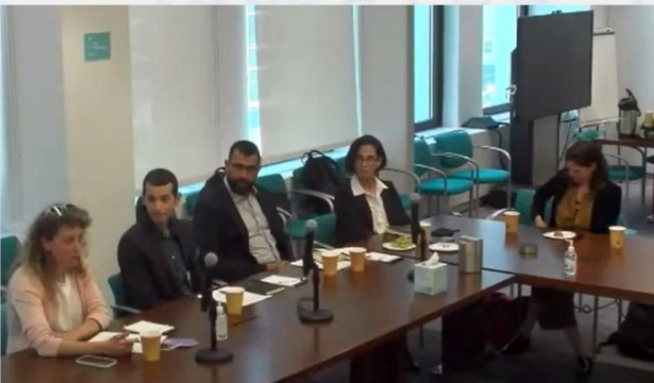
Professional Programs: Sikkuy Co-Directors discuss breakthroughs and fragility in Jewish-Arab relations in Israel.