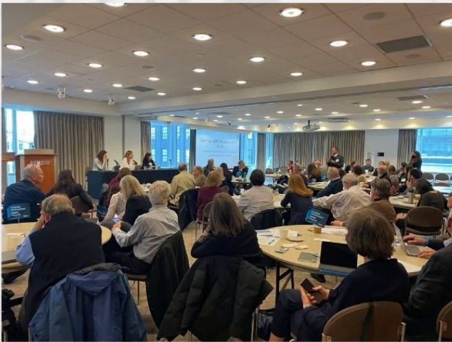
Annual Meeting Attendees