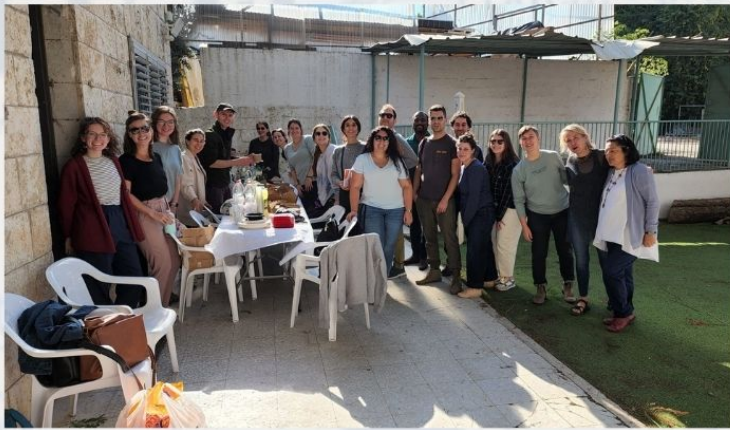
Field Visits. JDC Entwine Alumni visit the Rosing Center Open House in Ramle to learn about Jewish-Arab relations in mixed cities.

In 2022, IATF continued to partner with dozens of communal organizations around programming that deepened knowledge and awareness of Arab citizens and Jewish-Arab relations in American Jewish communities. Through in-person, hybrid, and in-the-field programs, IATF introduced Jewish and Arab experts on shared society, mixed cities, political partnership, economic development, housing and planning, access to employment and the start-up nation, and more, to diverse American Jewish audiences.