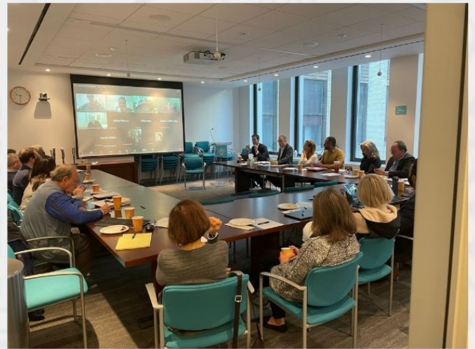
Foundation Forum Attendees

IATF's annual meetings brought together American Jewish leaders, funders, and professionals for two days of in-person learning about major priorities in the field and for ongoing IATF as an educator and convener. Just days before the new administration in Israel was inaugurated, our discussions delved into the headway that was made over two decades of socio-economic development efforts, priorities in light of changing government agenda, and the resilience, potential, and risk to the civil sector that grew in parallel.