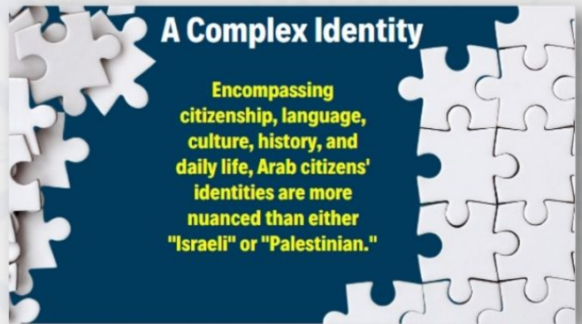
Slide from the Complex Identity module of the iCenter Certificate program