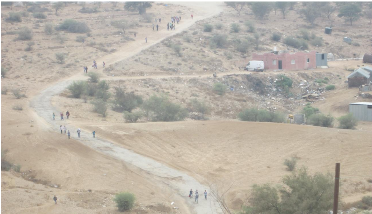
The children of Umm al-Hīrān walk towards the main road, where the school bus waits for them every day.

As of September 2015, 100 schools operate in the Bedouin villages in the Negev. 62 schools are located in the governmental planned towns, 28 in the newly recognized villages and only 10 in the unrecognized villages. 22 The state refuses to open schools in these villages referring to them as "diaspora" or "illegal villages", a status that renders them undeserving of official support. Repeated requests to open schools in these villages, where over 70,000 citizens reside, are denied by state officials and the only solution that is being offered to the residents is busing for pupils to schools far from home. In fact, although about 30% of the Bedouin population resides in unrecognized villages, only 10% of the schools are located there.