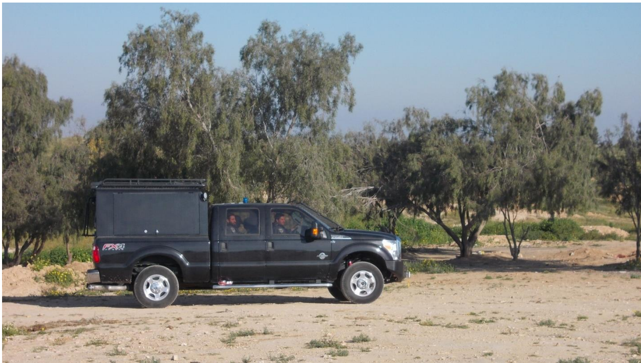
Vehicle of the Yoav police unit in the unrecognized village of al-‘Arāgīb.

of the fact that the road was closed with two barriers and there was an agreement between the police and the Rahaṭ Municipality that the police would not come into the area, in light of the tension in the city. When the patrol vehicle reached the heart of the funeral procession it was stoned and things rapidly got out of hand. Dozens of patrol cars arrived, covered by a helicopter with a siren that hovered over the cemetery, and the police began to attack the mourners in the cemetery with various weapons used for the dispersal of demonstrations. Over 40 were injured, 23 of whom, including 2 police officers, were evacuated to the Soroka Medical Center. Shortly after the death of Sami az-Ziadna was announced. Az-Ziadna was resident of Rahaṭ in his 40's who had participated in the funeral and had died while the police was attacking the mourners.