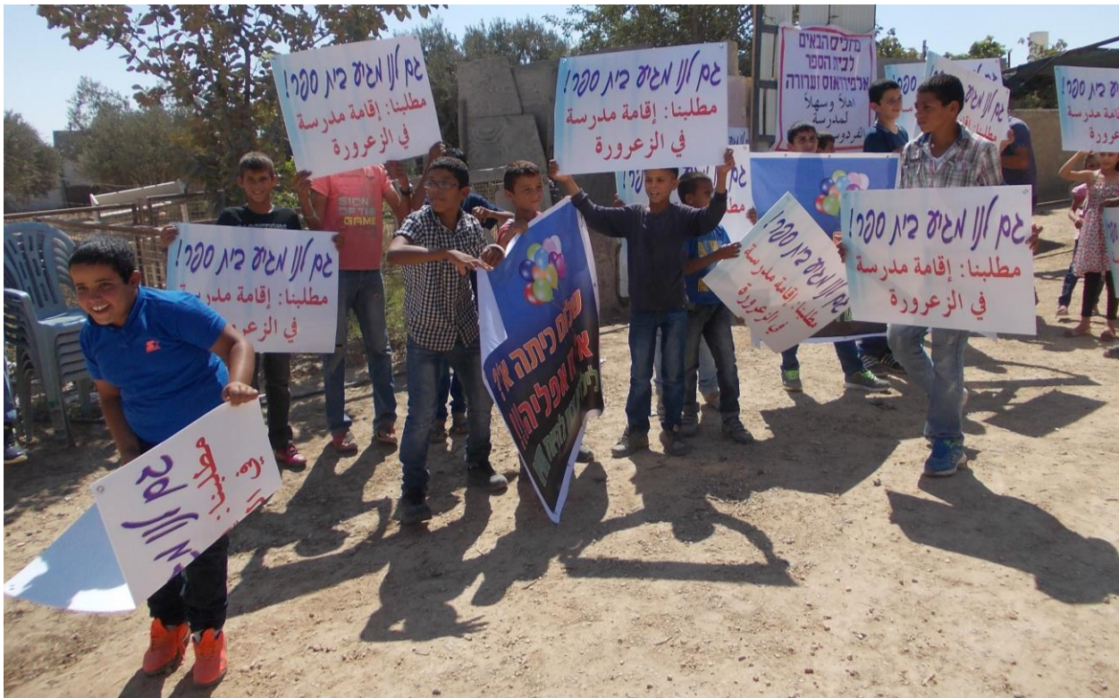
The children of az-Za‘arūrah striking on September 1 st , 2015, and protesting demanding to open a school in their village.

In spite of the tension noted by the judges of the High Court of Justice, the state, as well as the High Court, continue favoring the state's interest in land. As a result, the state sees the demolition of the unrecognized villages and the transferring of its residents to the governmental planned towns as a solution to these issues, rather than providing the citizens in the unrecognized villages their right for accessible education. The process of regulation of the Bedouin settlement is a lengthy one and its conclusion does not seem to be close. Yet, in the meantime, the state prefers to deny its Bedouin citizens the basic right to education and instead spends enormous sums of money on busing with the sole purpose of not opening new schools.