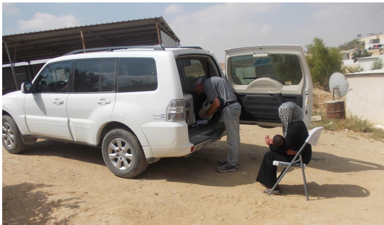
The mobile health unit that has ceased operating in the village of ‘Atir.

Government resolution 3965 Arab/40 of 2005 stipulates that: “The Ministry of Health will plan Mother and Child centers (family health centers) in the new villages so that in each village at least one center will be built between 2005-2008, with a 7.8 million shekels budget”. 21 Since 2005, this resolution has not been implemented. Despite several extensions, in 2015, some of the recognized villages still do not have the promised family health centers.