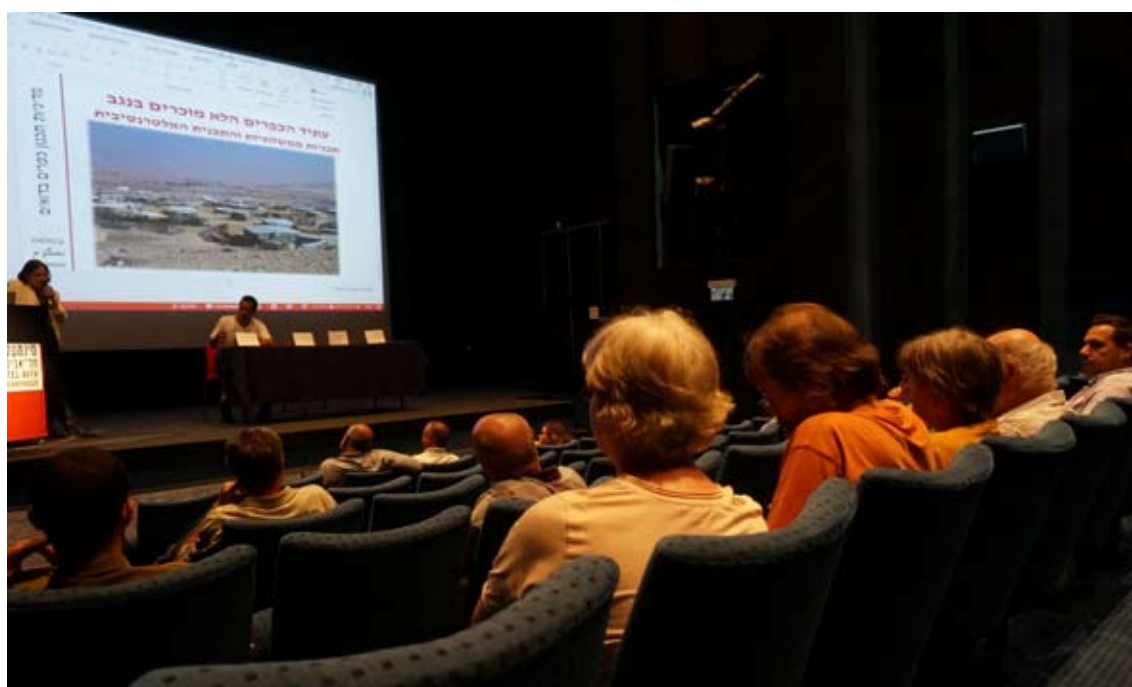
Panel about the situation in the Negev during NCF's film festival at the Tel Aviv Cinematheque, November 2013