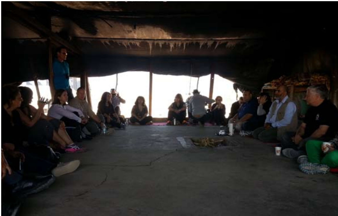
Field trip with the group "Honest Reporting Australia" in the Bedouin unrecognized village of Wadi A-Na'am, November 2013

On November 6th and November 7th, NCF held two days of documentary films and discussions about the Naqab at the Tel Aviv Cinematheque. The event was planned in this alternative venue to attract a diverse audience and was successfully executed. It attracted some 300 people, many of whom joined NCFs' mailing list, explored and took home the available literature about the negev and participated in the organized panel-discussions.