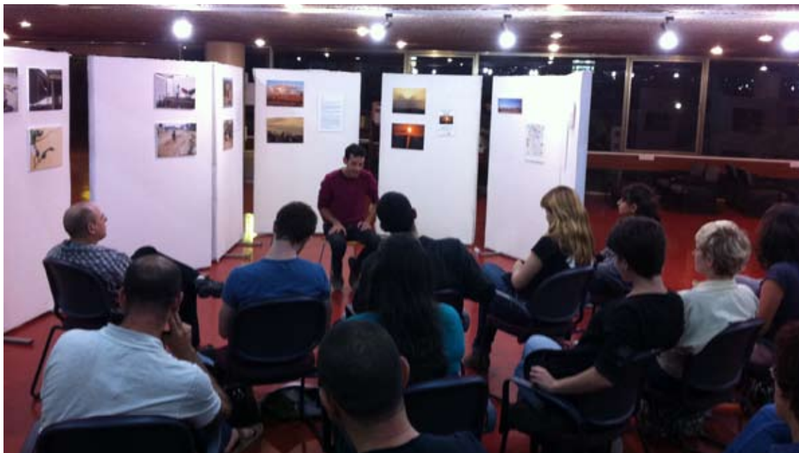
Lecture about the Negev during NCF's photo-exhibition at Tel Aviv University, October 2013