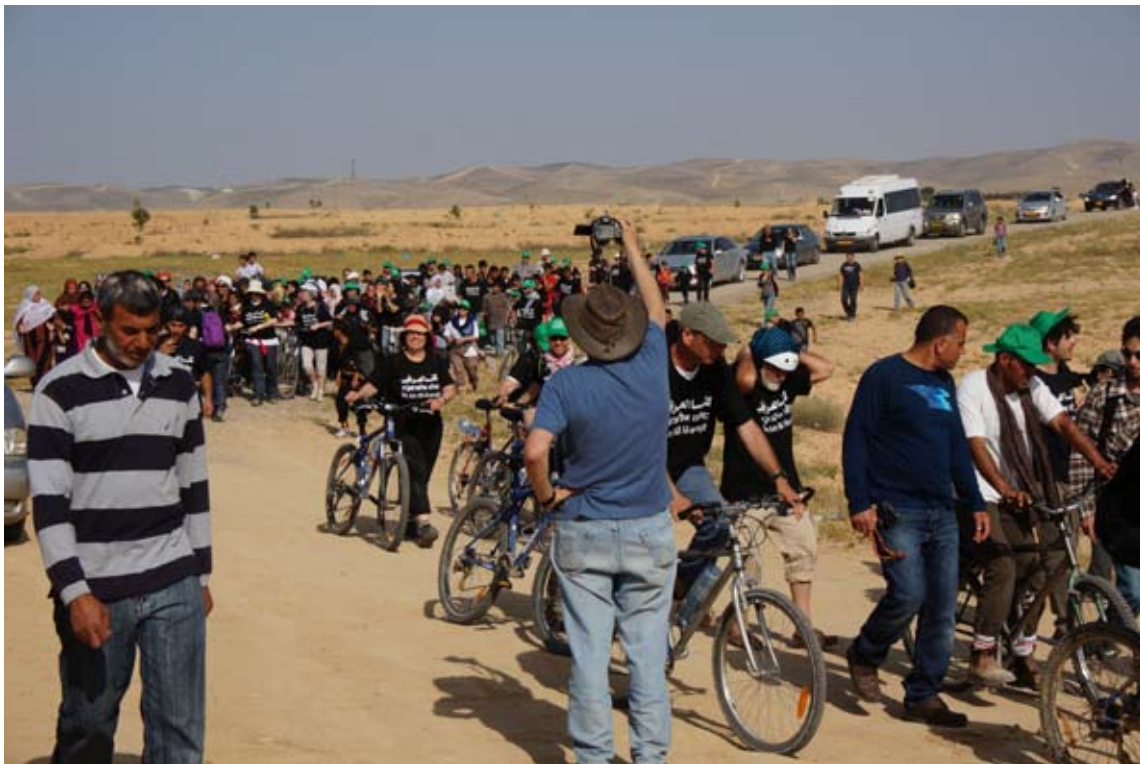
Dozens of participants in the "Cycling for Recognition" 5 days cycling tour among the Bedouin villages in the Negev arrive at the final event in the village of Al-Arakib, April 2013

In 2013 NCF held six discussions circles which attracted 101 participants. In this activity our Jewish and Bedouin staff is invited into the homes of Jewish Israelis to discuss democracy and human rights in the Negev. The discussions tackle difficult subjects such as recognition of indigenous land rights and highlight the hurdles that the Bedouin face in accessing their rights despite their full citizenship. The group discussions are aimed at diversifying our audience and appeal to Jewish Israelis who are not necessarily politically active or familiar with the Negev. In 2013 these were held in locations in Jerusalem and Be'er Sheva.