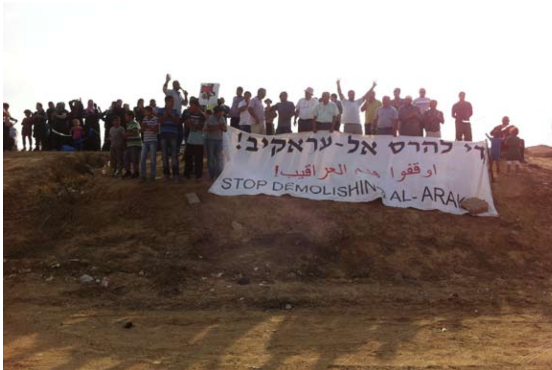
NCF's placards for the protest against "Praver Plan", August 2013