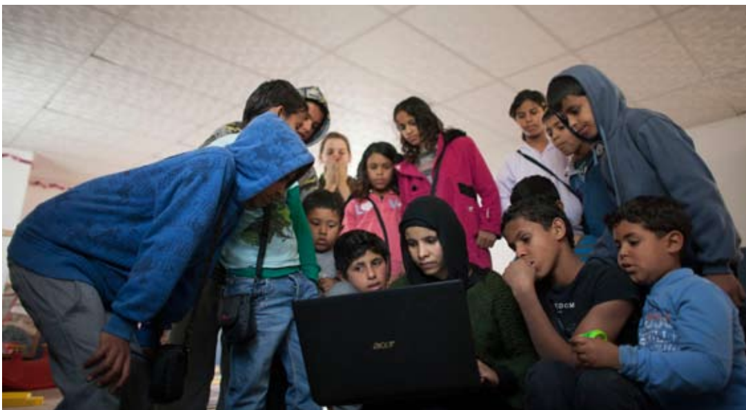
Photography workshop for the children of the Bedouin unrecognized village of Khasham Zaneh, January 2013

The photographs taken during the workshop have been presented at a number of photo-exhibitions, in order to raise awareness of the situation in the unrecognized Bedouin villages in the Negev.